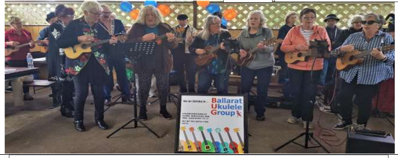
Ballarat Ukelele Group performed at the IPDwD in Ballarat providing some upbeat tunes